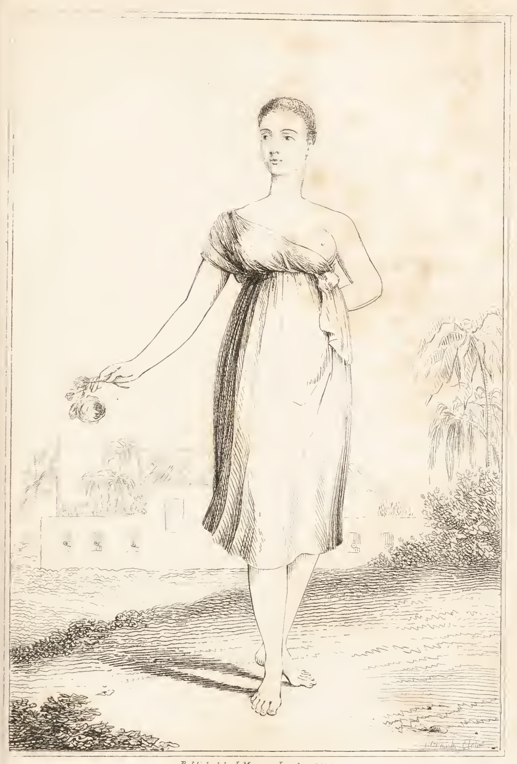
Published by I, Murray, London, 1820.